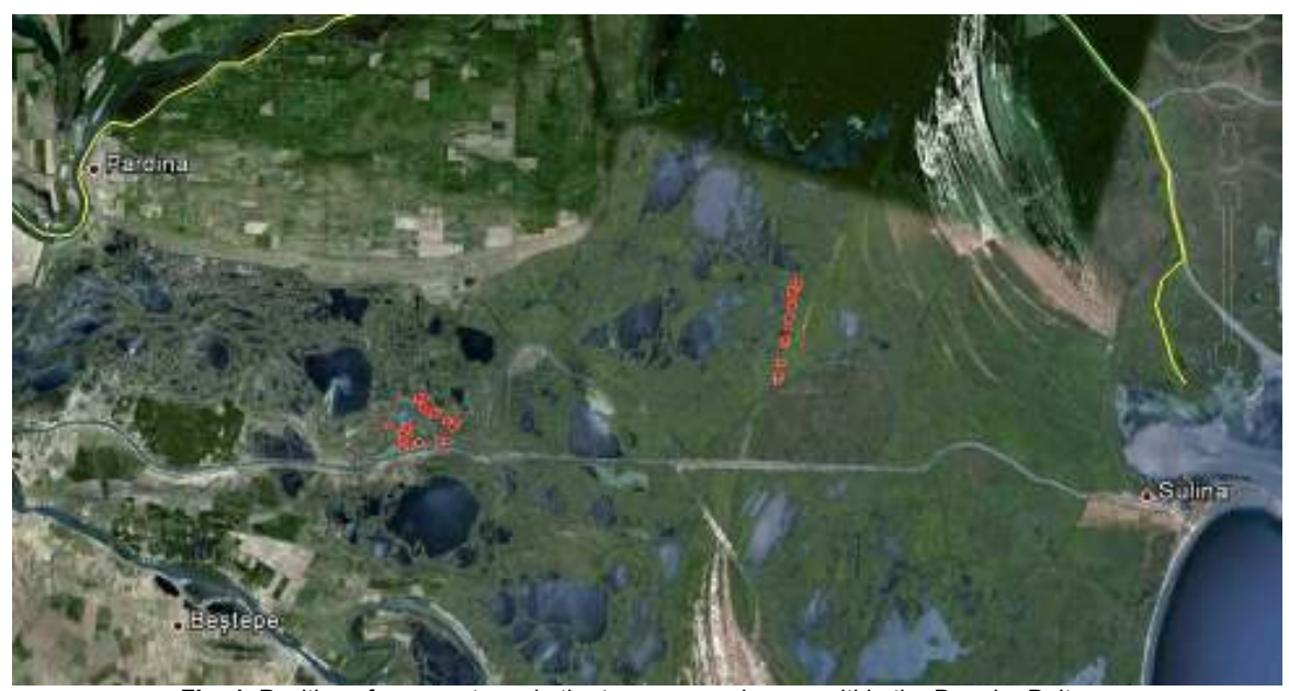
Fig. 1. Position of camera-traps in the two surveyed areas within the Danube Delta. Note . background satellite map