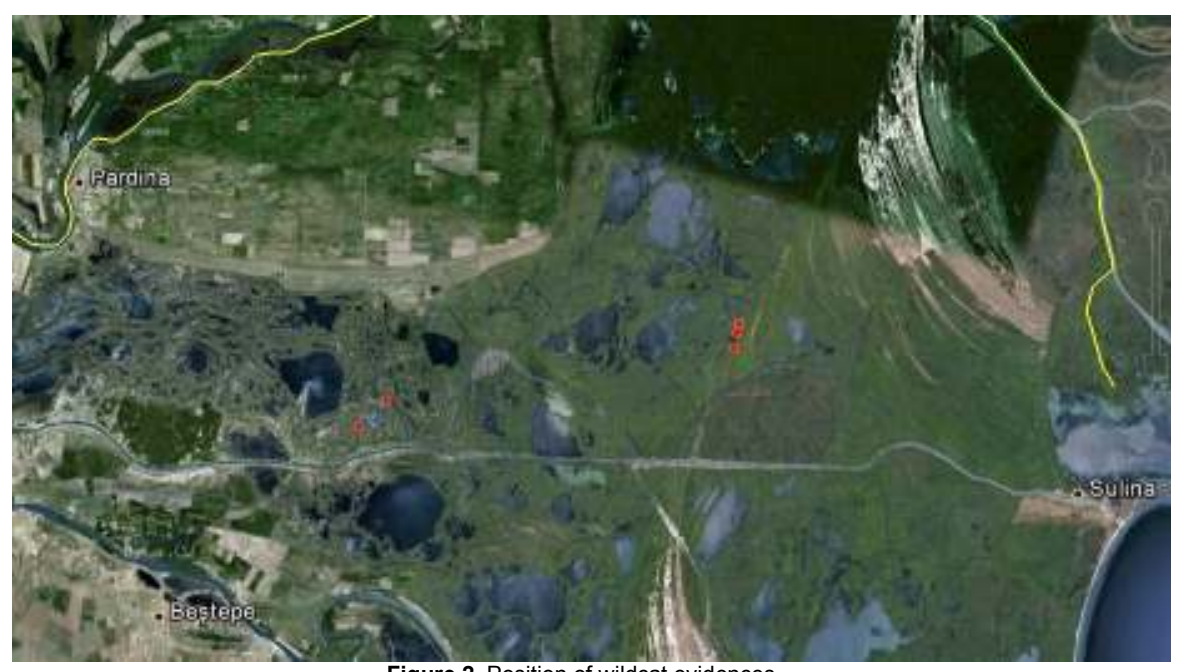
Figure 2. Position of wildcat evidences Note. background satellite map